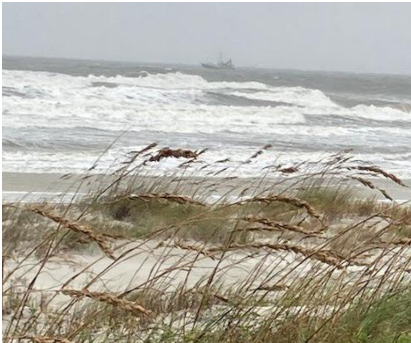
The Atlantic not far south of the Mayport FL naval station Destroyers and carriers cross these waters daily