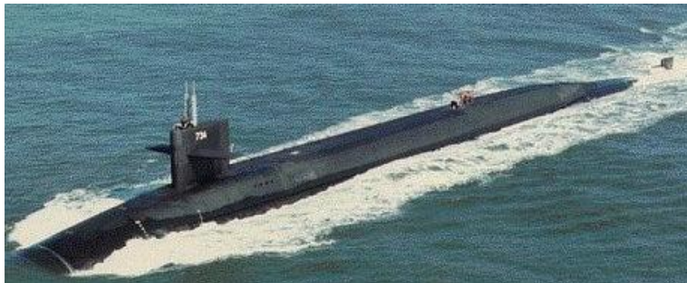
USS Tennessee SN734 ...at sea